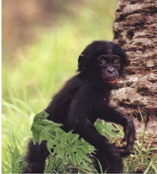
a Bonobo youth sports the latest fashion trend