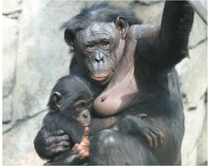
a concerned Bonobo mother

“What she is doing is manipulating impressionable young girls. Most girls aren’t covering their genitals because they really believe in monogamy, they dress that way because its what they see in the media,” one mother commented.