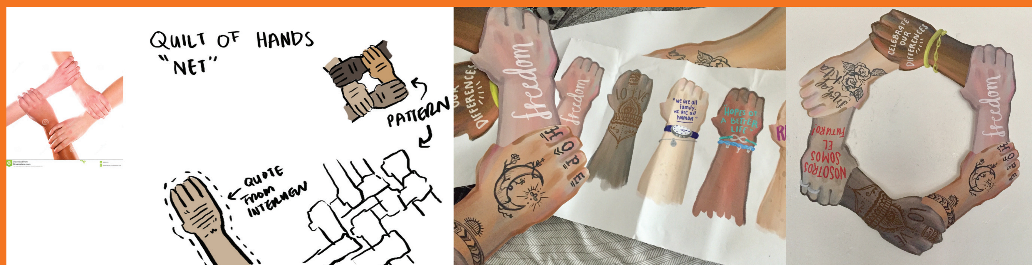
example of student work contributed by a Transfer Session participant

Discovering the potential for transfer of learning through cross-disciplinary pedagogical dialogue